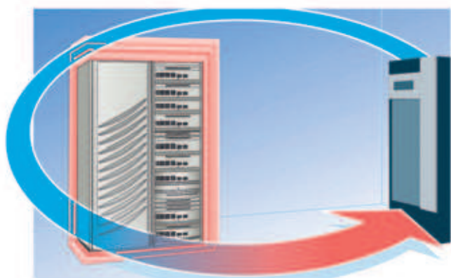
Precision air conditioning unit: air output 300 m 3 /h per kW