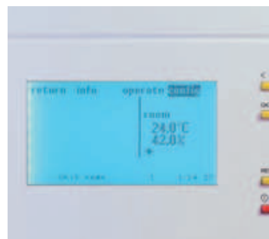
C7000 Advanced user interface